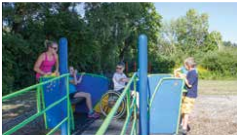
Cruiser Accessible Rocker

Burke offers a vast array of interactive, challenging and educational play events. Sensory components like interactive panels, are great additions to any playground. Our Cruiser accessible rocker and Volito swing add exciting movement and team work to your space. Counters are a fun, cost-effective way to add places for children to socialize.