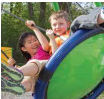
Volito Multi-User Swing

Play events that sway, swing or spin help kids develop necessary perceptual skills, spacial awareness and sensory integration. They can also help to build strength, balance and coordination and best of all, they're just plain fun!