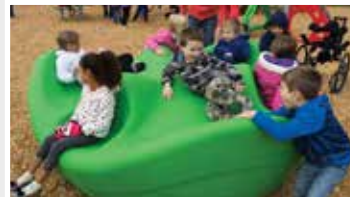
Volta™ Inclusive Spinner