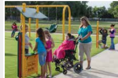
SENSORY PLAY: Drive Thru with Fun Phone

This ramp system winds around the entire playground from ground-level up to 72" giving all children access to the entire play space. The Trike Trail around the playground allows for great imaginative play with Cozy Corners, a Drive Thru and Gas Station. Burke Turf is the perfect finishing touch, adding seamless accessibility throughout the entire space.