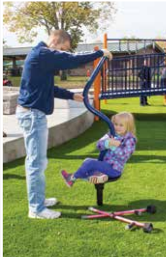
MOTION: Swift Twist Spinner