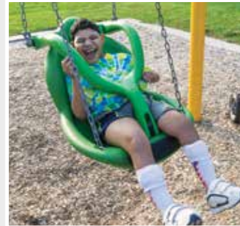
Freedom Inclusive Swing Seat

Play events that sway, swing or spin help kids develop necessary perceptual skills, spacial awareness and sensory integration. They can also help to build strength, balance and coordination and best of all, they're just plain fun!