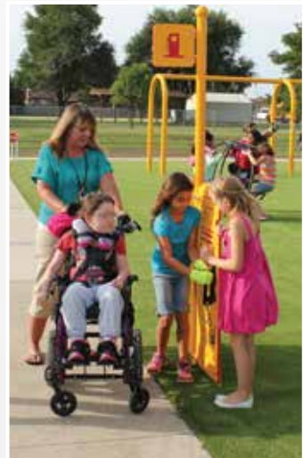
SOCIAL PLAY: Gas Station