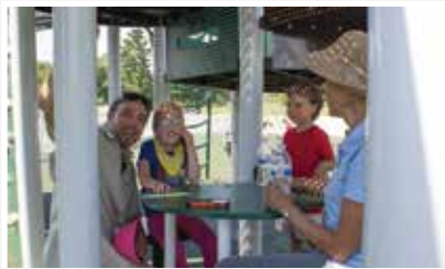
Activity Table & Benches