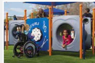
SOCIAL PLAY: Interactive Play Area