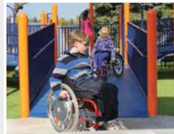
ACCESS: Double Wide Ramps

This space was created to allow accessibility throughout the entire play space, including the area around and under the play structure. The Double Wide Ramp system allows for two wheelchairs to pass or move alongside each other. The tunnel and play panel area creates a ground-level play area for all children to socialize and learn together.