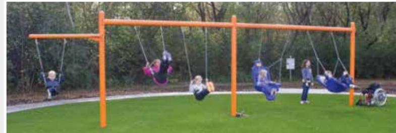
MOTION: Swings with Tot, Belt and Adaptive Seats

Flip the page to see the DELIVERED inclusive play space.