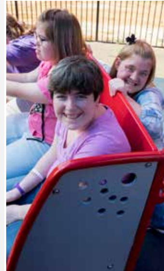
Cruiser Accessible Rocker