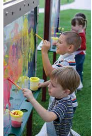
SENSORY: Paint Centers