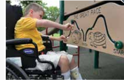
Accessible Reach Panels