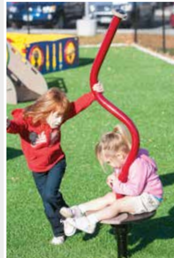
MOTION: Swift Twist Spinner

This playground incorporates a great variety of ground-level play events that allow all children to access tons of play opportunities. The sensory rich play space includes paint centers, interactive panels, sand and water play, tunnels, climbers and more. The separate active and relaxed play areas create a variety of events for children to choose from.