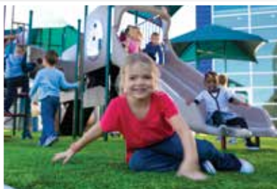
ACCESS: Burke Turf Safety Surfacing

This playground incorporates a great variety of ground-level play events that allow all children to access tons of play opportunities. The sensory rich play space includes paint centers, interactive panels, sand and water play, tunnels, climbers and more. The separate active and relaxed play areas create a variety of events for children to choose from.