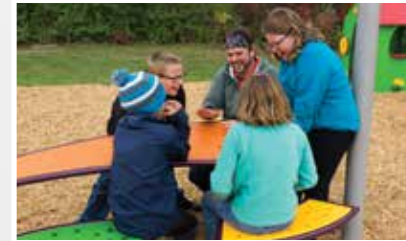
Novo™ Playful Furniture