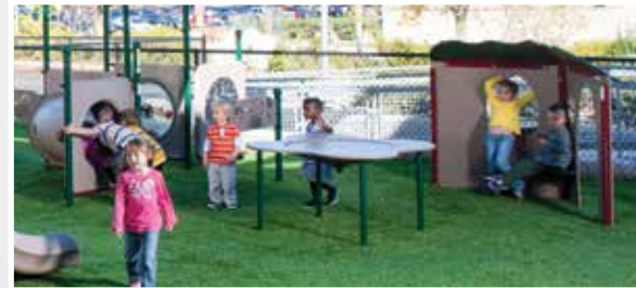
VARIETY: Relaxed Social and Sensory Play Area

Flip the page to see the DELIVERED inclusive play space.