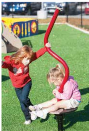
MOTION: Swift Twist Spinner

This playground incorporates a great variety of ground-level play events that allow all children to access tons of play opportunities. The sensory rich play space includes paint centers, interactive panels, sand and water play, tunnels, climbers and more. The separate active and relaxed play areas create a variety of events for children to choose from.