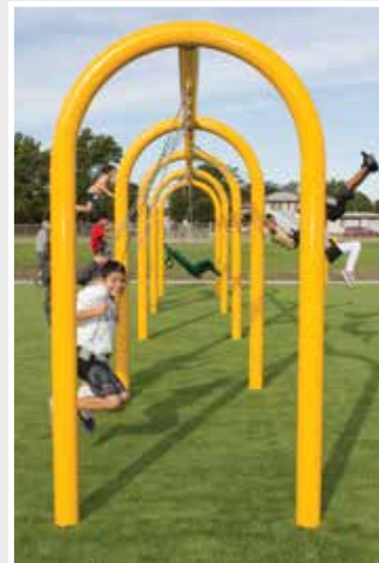
MOTION PLAY: Swings

This ramp system winds around the entire playground from ground-level up to 72" giving all children access to the entire play space. The Trike Trail around the playground allows for great imaginative play with Cozy Corners, a Drive Thru and Gas Station. Burke Turf is the perfect finishing touch, adding seamless accessibility throughout the entire space.