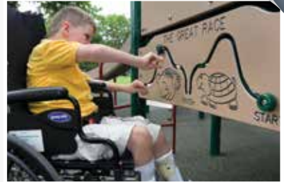
Accessible Reach Panels