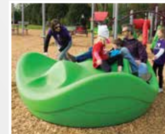
Volta Inclusive Spinner