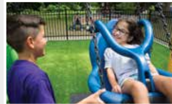
SENSORY: Activity Panels

This space was created to allow accessibility throughout the entire play space, including the area around and under the play structure. The Double Wide Ramp system allows for two wheelchairs to pass or move alongside each other. The tunnel and play panel area creates a ground-level play area for all children to socialize and learn together.