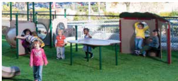
VARIETY: Relaxed Social and Sensory Play Area

Flip the page to see the DELIVERED inclusive play space.