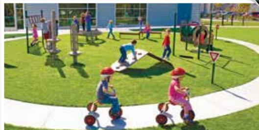
VARIETY: Active Play Area