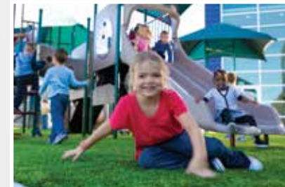
ACCESS: Burke Turf Safety Surfacing

This playground incorporates a great variety of ground-level play events that allow all children to access tons of play opportunities. The sensory rich play space includes paint centers, interactive panels, sand and water play, tunnels, climbers and more. The separate active and relaxed play areas create a variety of events for children to choose from.