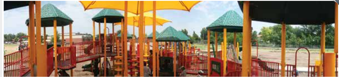
ACCESS: ADAAG Ramps

Flip the page to see the DELIVERED inclusive play space.