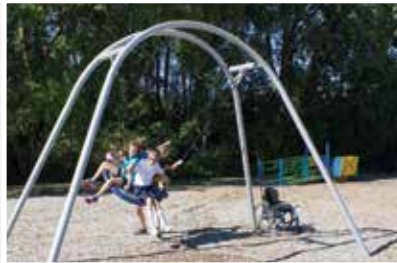
Volito Multi-User Swing