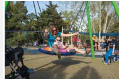
Volito Multi-User Swing