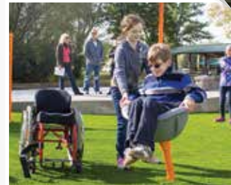
MOTION: KidForce Spinner