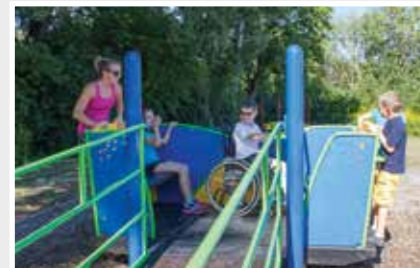
Cruiser Accessible Rocker