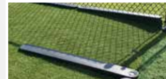
Burke Turf with Entrance Ramp