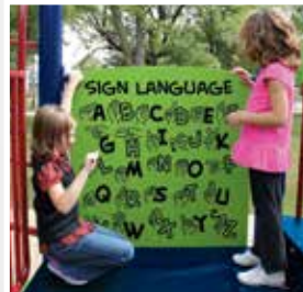
Sign Language Panel