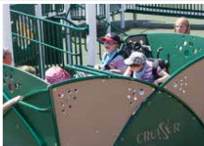
Cruiser Accessible Rocker