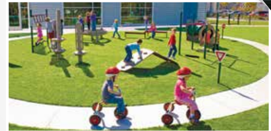
VARIETY: Active Play Area