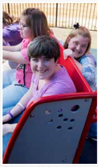
Cruiser Accessible Rocker