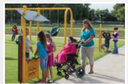
SENSORY PLAY: Drive Thru with Fun Phone

This ramp system winds around the entire playground from ground-level up to 72" giving all children access to the entire play space. The Trike Trail around the playground allows for great imaginative play with Cozy Corners, a Drive Thru and Gas Station. Burke Turf is the perfect finishing touch, adding seamless accessibility throughout the entire space.