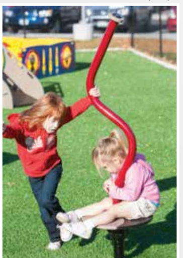
MOTION: Swift Twist Spinner

This playground incorporates a great variety of ground-level play events that allow all children to access tons of play opportunities. The sensory rich play space includes paint centers, interactive panels, sand and water play, tunnels, climbers and more. The separate active and relaxed play areas create a variety of events for children to choose from.