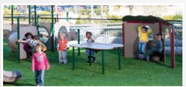
VARIETY: Relaxed Social and Sensory Play Area