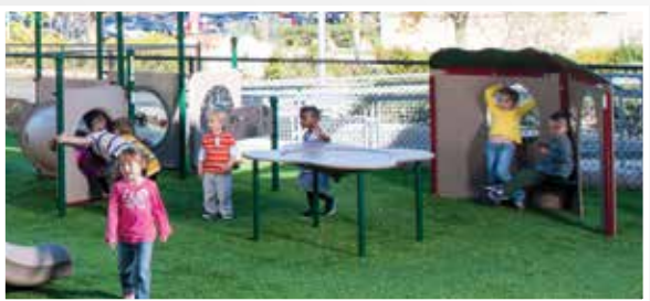
VARIETY: Relaxed Social and Sensory Play Area