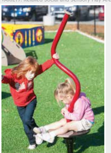
MOTION: Swift Twist Spinner