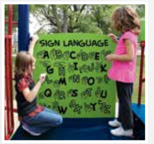
Sign Language Panel