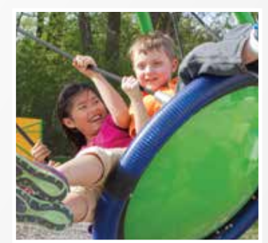
Volito Multi-User Swing

Play events that sway, swing or spin help kids develop necessary perceptual skills, spacial awareness and sensory integration. They can also help to build strength, balance and coordination and best of all, they're just plain fun!