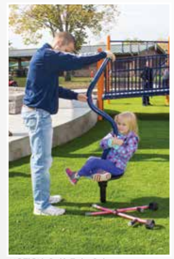
MOTION: Swift Twist Spinner