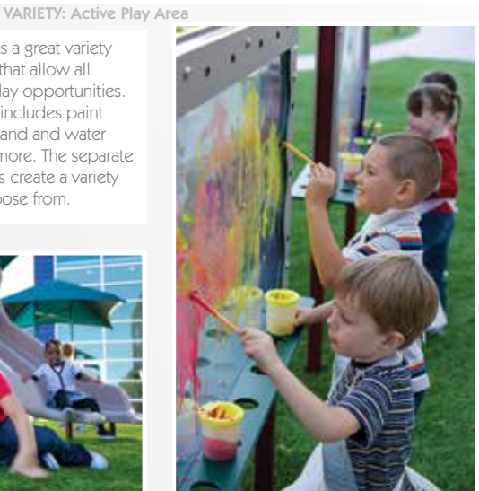
SENSORY: Paint Centers