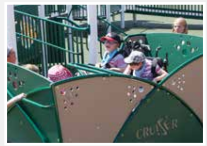
Cruiser Accessible Rocker