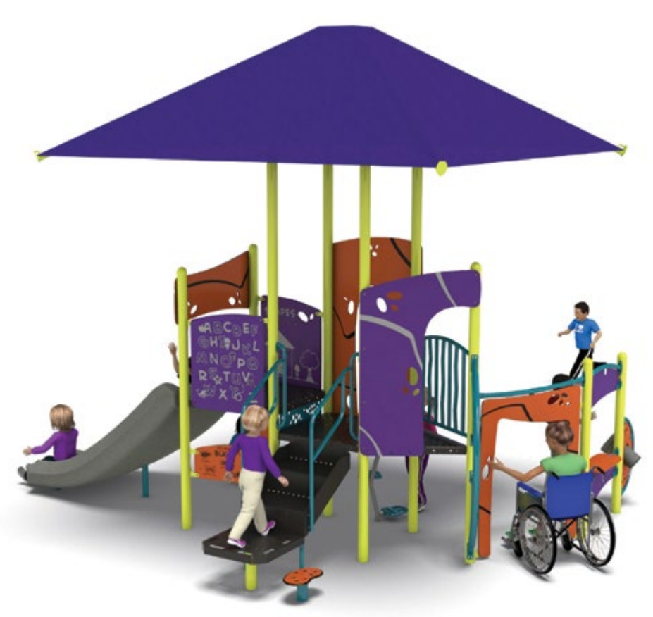
SY-2896 Ages 2-5 | 35 Kid Capacity | 28' x 29' ASTM Use Zone