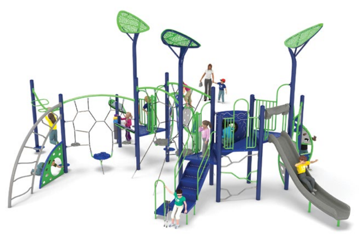
NUIN-2873 Ages 5-12 | 73 Kid Capacity | 39' x 50' ASTM Use Zone