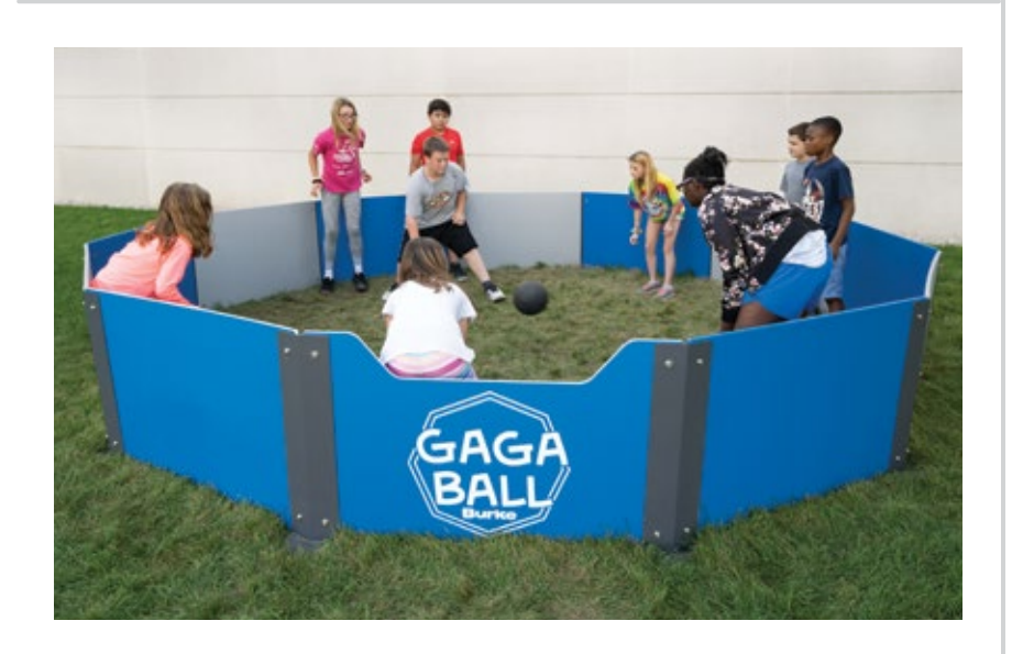
GAGA BALL PIT 590-0077 | Ages 5-12 | 35 Kid Capacity | 32' x 33' ASTM Use Zone

Ages 5-12 & 13+ | 33 Kid Capacity | 51' x 80' ASTM Use Zone FIT-2628 photo features a custom Burke Turf design. Contact your local Burke Representative for safety surfacing options as required by ASTM F3101-15 safety standard for unsupervised outdoor fitness equipment.