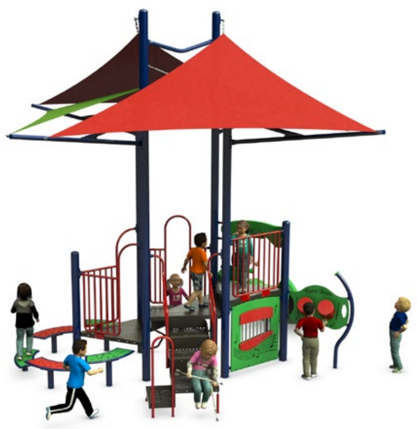
NU-2777 Ages 2-5 | 37 Kid Capacity | 27' x 30' ASTM Use Zone