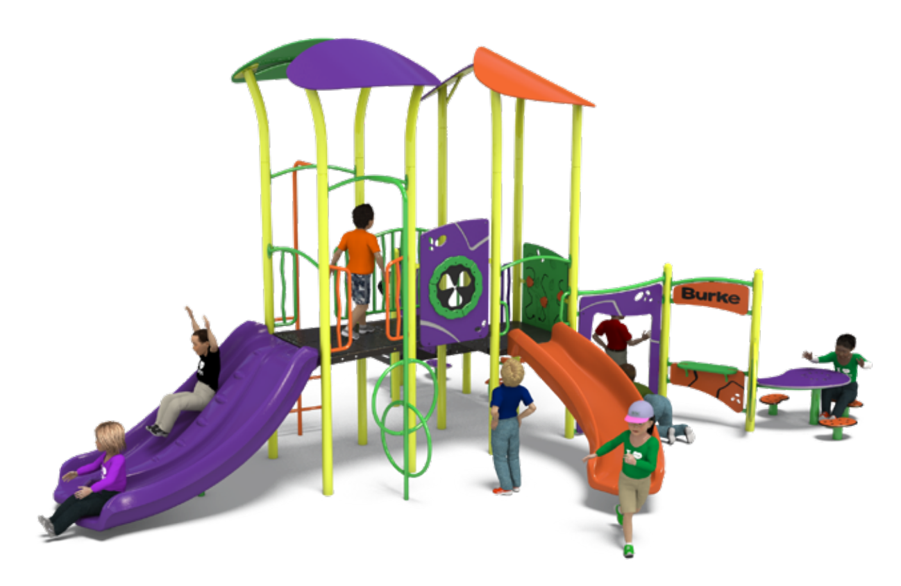
$Y-2916 Ages 2-5 | 24 Kid Capacity | 38' x 29' ASTM Use Zone