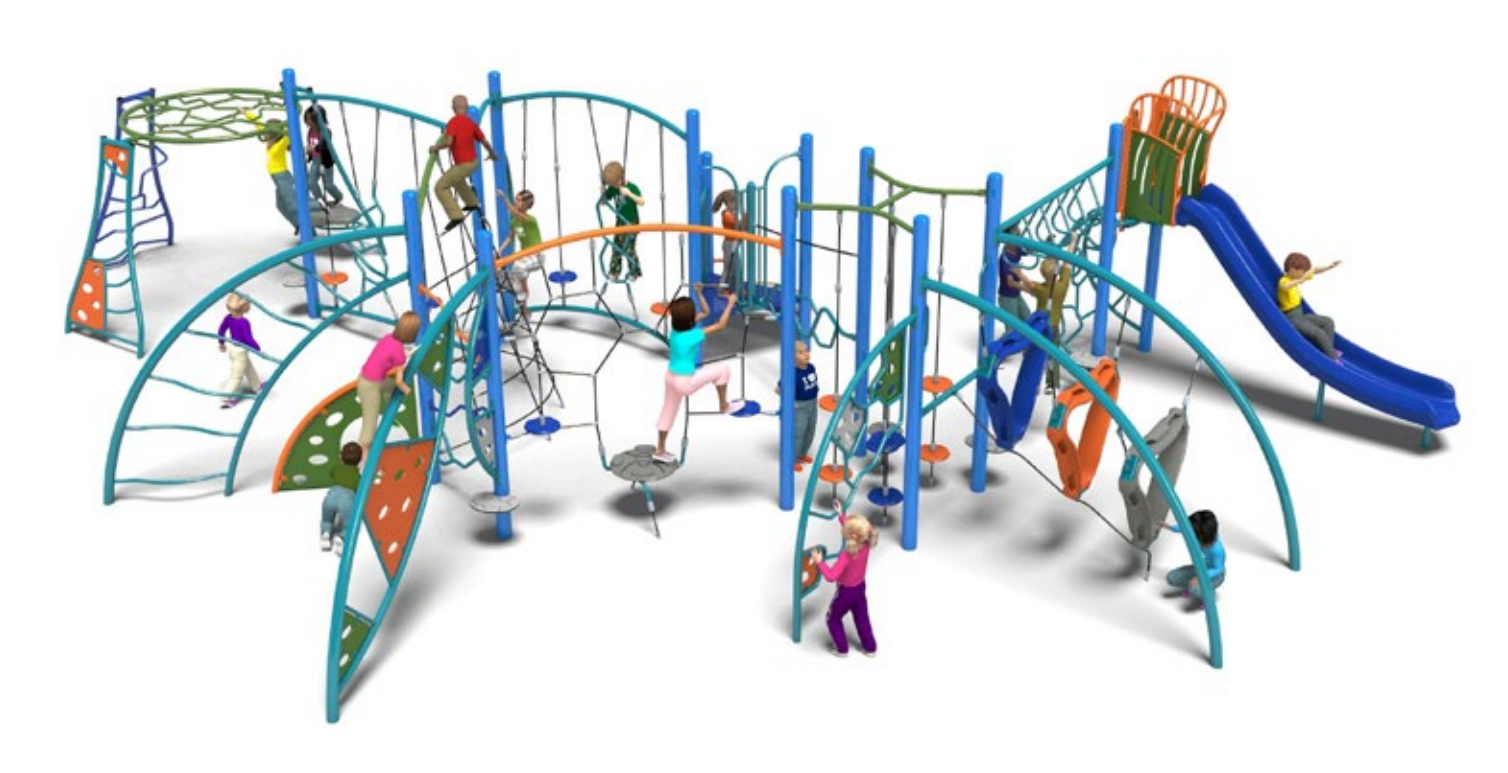
IN-2956 Ages 5-12 | 114 Kid Capacity | 44' x 59' ASTM Use Zone