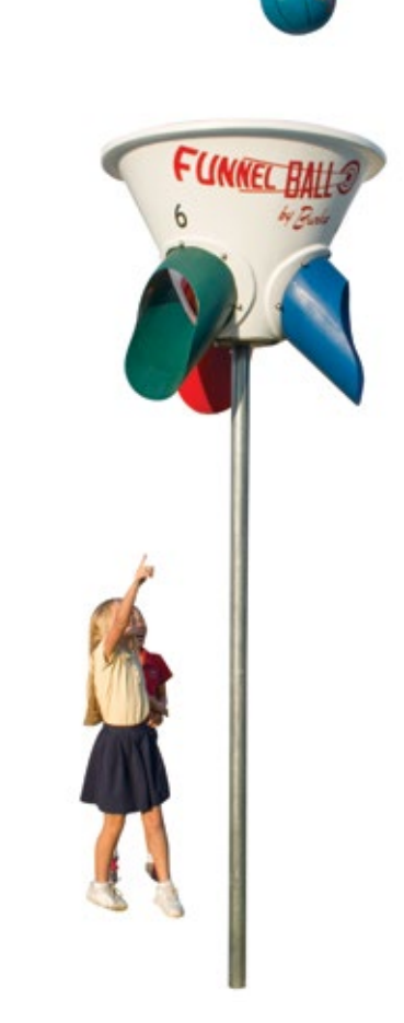
FUNNEL BALL 590-0062 | Ages 2-12 | 6 Kid Capacity