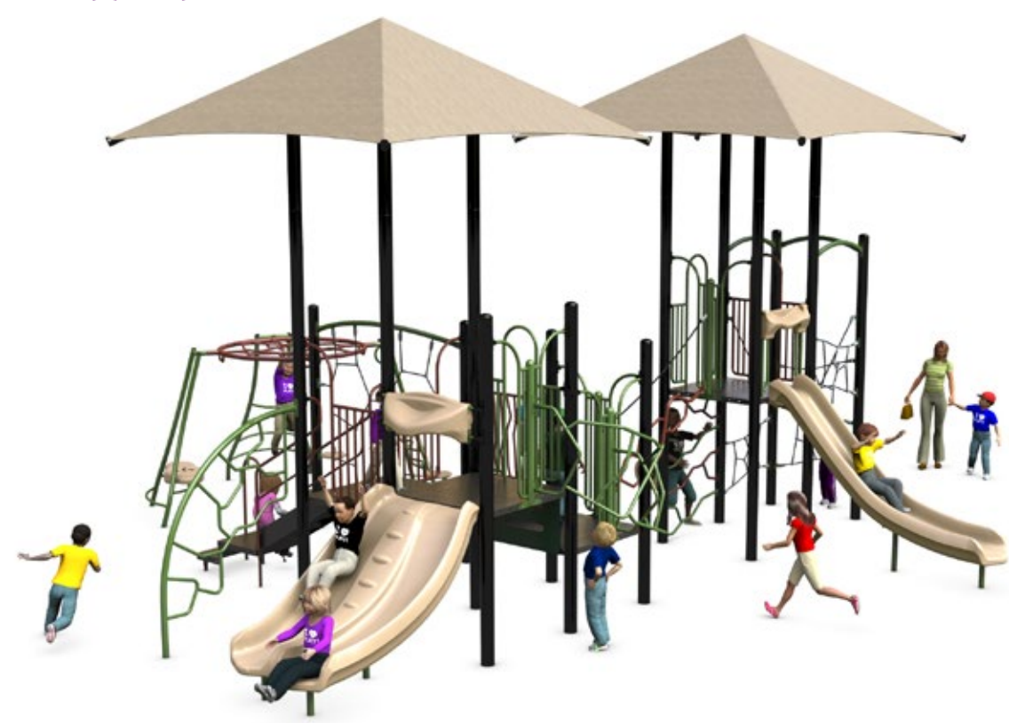
NUIN-2855 Ages 5-12 | 100 Kid Capacity | 48' x 42' ASTM Use Zone