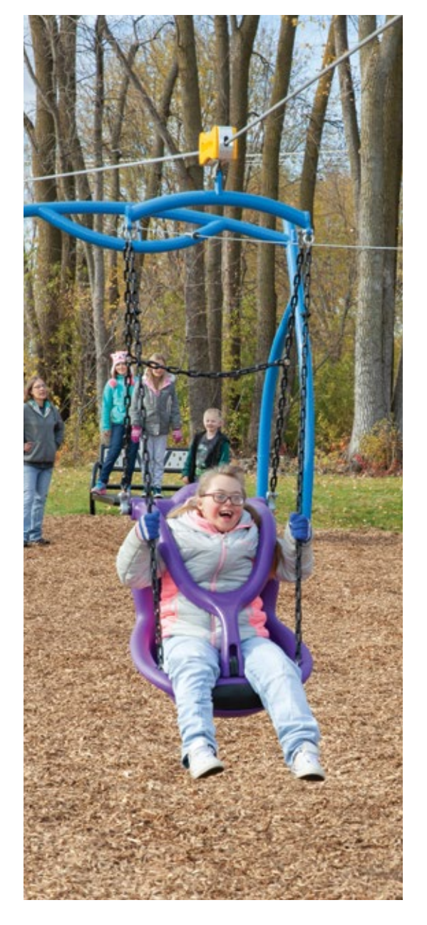
ZIPVENTURE® FREEDOM 550-0197 | Ages 5-12 | 1 Kid Capacity 23' x 94' ASTM Use Zone