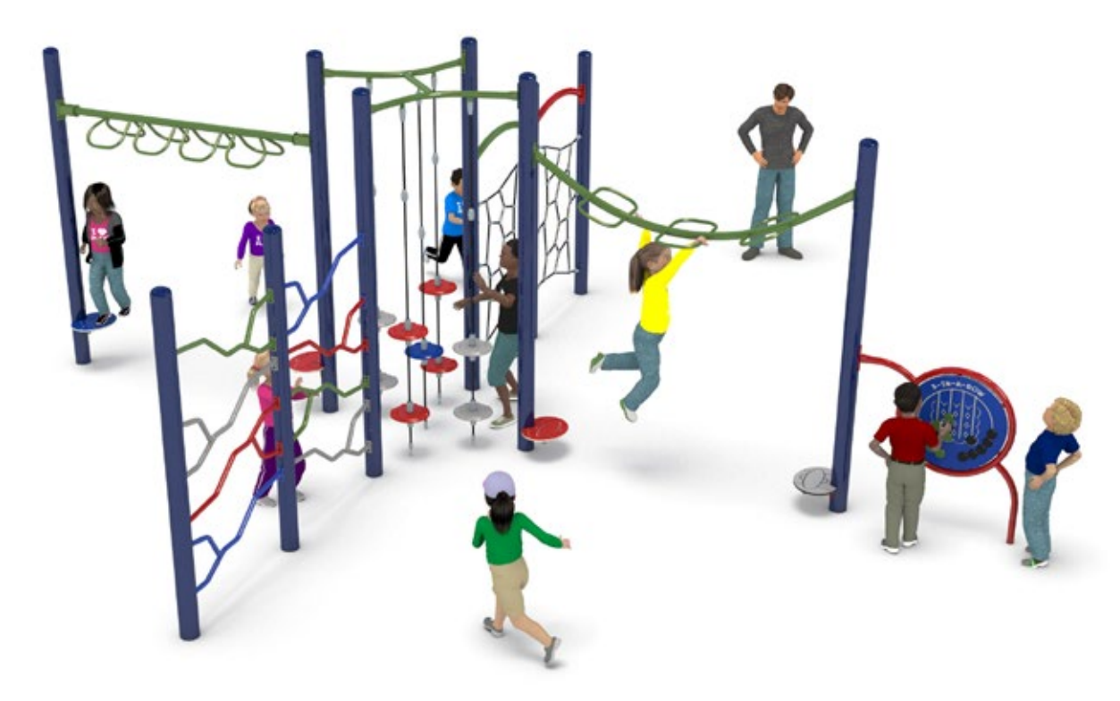
IN-2882 Ages 5-12 | 41 Kid Capacity | 29' x 29' ASTM Use Zone