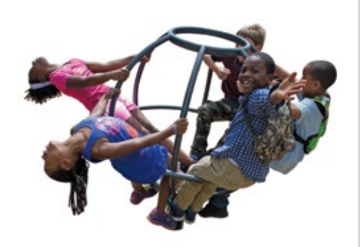
COMET I 560-2586 | Ages 5-12 | 6 Kid Capacity 16' Diameter ASTM Use Zone