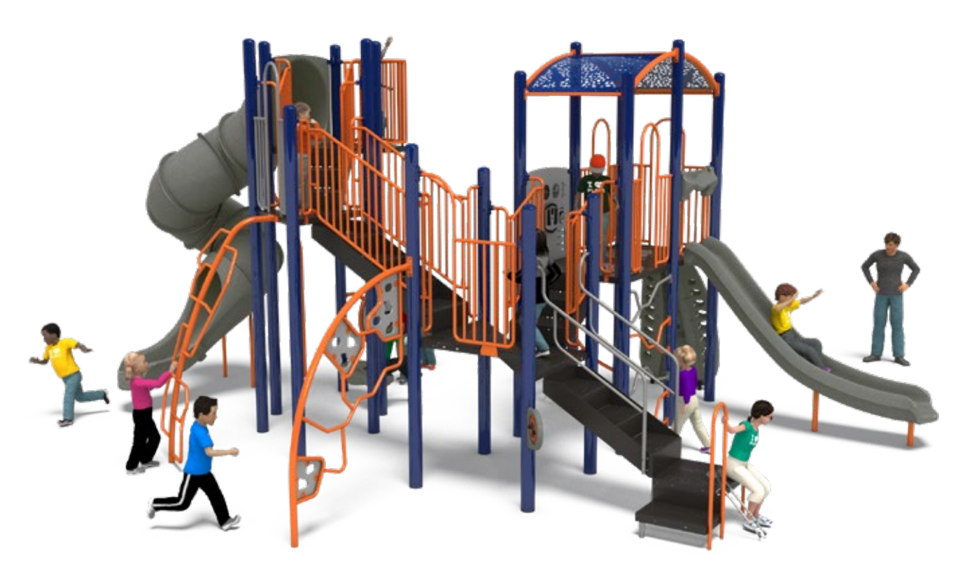
NU-2910 Ages 5-12 | 80 Kid Capacity | 42' x 35' ASTM Use Zone