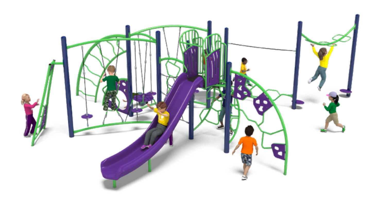
IN-2912 Ages 5-12 | 53 Kid Capacity | 35' x 44' ASTM Use Zone