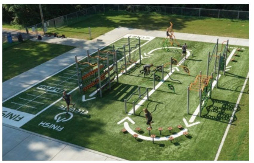
ELEVATE FITNESS COURSE® FIT-2628

Visit bciburke.com/sale to view all sale structures!