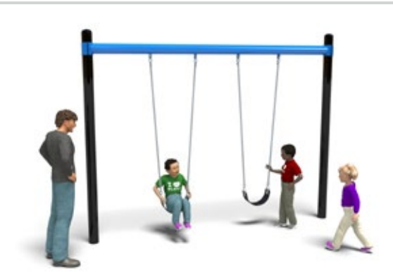
SINGLE POST SWING BB-2952 | Ages 2-12 | 2 Kid Capacity 32' x 24' Use Zone